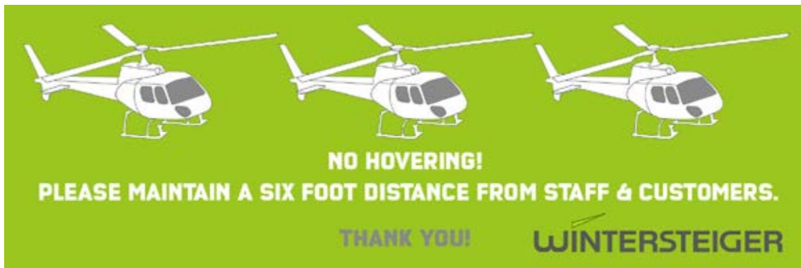
48" x 16" No Hovering Graphic