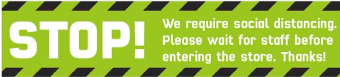
12" x 3" STOP Graphic