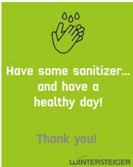
8.5" x 11" Sanitizer Graphic