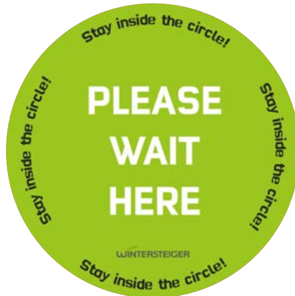
24" Diameter Wait Here Circle